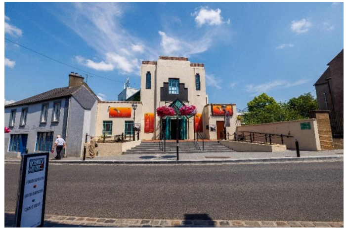
Watergate Theatre, Parliament Street, Kilkenny

None of these parking facilities belong to the Watergate Theatre. For those with access needs early arrival increases but does not guarantee use of these facilities.